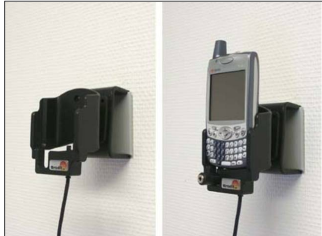
4. 4. The holder is in place.