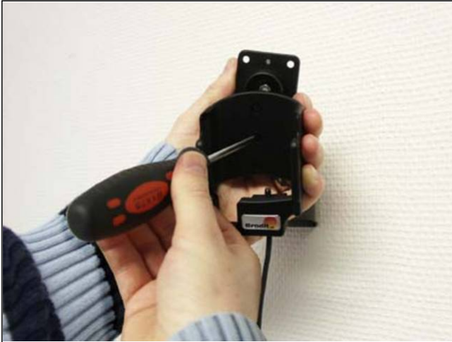
1. 1. Loosen the screw in the center of the holder so you can remove the attaching part on the back. Place the attaching part on desired position. Screw the attaching part into place with the enclosed screws.

ProClip USA, Inc. may not be held liable for any personal injury or damage to a vehicle or device, resulting from accident or improper use or installation, before, during or after the installation or removal of this mount and/or holder.