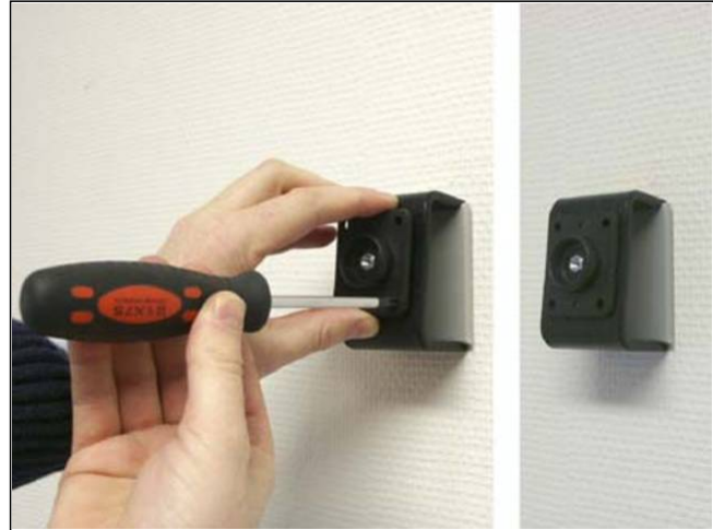
2. 2. Place the holder over the attaching part.